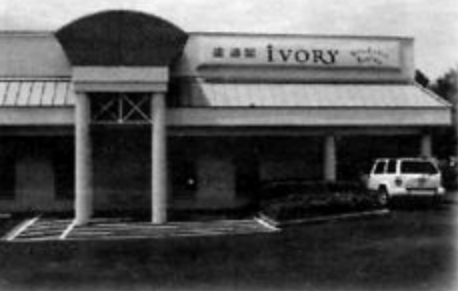
Ivory Mandarin Bistro, 2192 Main Street: Fine Asian Dining without compromise.

These days, one may travel to the orient and still not manage to obtain authentic Chinese cuisine. American chain restaurants dot the orient and western influences on the native food abound. Likewise, in the United States, much of the Chinese food labelled as "authentic" is anything but. Bridging the gap between authentic Chinese and Chinese-American is no easy feat. Food critics have been known to take to task many restaurant claims of "authentic" Chinese food, maintaining when an ingredient is omitted, substituted, or added, the integrity of the dish is instantly compromised. Nothing could be further from the truth at The Ivory Mandarin Bistro, located on Main Street in Dunedin. The location has long housed Chinese restaurants, but it is only the most recent incarnation that is receiving the accolades it deserves. The new owners practically gutted the interior and their remodeling efforts are nothing short of spectacular. The fact that this is a non typical Asian cuisine restaurant is readily apparent upon entry. Gone are the dark and dim lights, as are the deep red and jade-green colors one is apt to find in most Chinese restaurants. The ambience delivers a bright atmosphere with an upscale flair and a class of service one is loathe to find in many comparable dining establishments. White linen table-cloths adorn