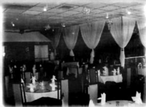
The Elegance of Fine Asian Dining is found here at Ivory Mandarin Bistro

Of worthy mention is the second "secret" menu The Ivory Mandarin Bistro offers. While not as large as their main menu, this menu does offer over seventy five items. The menu is usually reserved for only those who request it and is extremely popular with the local Asian population, as the prepared dishes are practically exact replicas of the bona fide fare found in their homeland. Steamed Fish (your selection of Grouper, Snapper, or Flounder, in season) with Ginger Scallion Sauce is among the favorites, as is the Peppercorn Combo of Shrimp, Squid, and Scallops, but again, it is the Duck that is all the rage among the local Asian food connoisseurs.