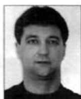
by William Stone

These days, one may travel to the orient and still not manage to obtain authentic Chinese cuisine. American chain restaurants dot the orient and western influences on the native food abound. Likewise, in the United States, much of the Chinese food labelled as "authentic" is anything but. Bridging the gap between authentic Chinese and Chinese-American is no easy feat. Food critics have been known to take to task many restaurant claims of "authentic" Chinese food, maintaining when an ingredient is omitted, substituted, or added, the integrity of the dish is instantly compromised. Nothing could be further from the truth at The Ivory Mandarin Bistro, located on Main Street in Dunedin. The location has long housed Chinese restaurants, but it is only the most recent incarnation that is receiving the accolades it deserves. The new owners practically gutted the interior and their remodeling efforts are nothing short of spectacular. The fact that this is a non typical Asian cuisine restaurant is readily apparent upon entry. Gone are the dark and dim lights, as are the deep red and jade-green colors one is apt to find in most Chinese restaurants. The ambience delivers a bright atmosphere with an upscale flair and a class of service one is loathe to find in many comparable dining establishments. White linen table-cloths adorn